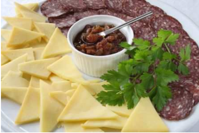
A selection of Knockanore Farmhouse cheeses.

Knockanore Irish Farmhouse Cheeses and Barron's Brown & White Yeast Rolls complemented by a cool glass of Crinnaghtau Pure Apple Juice.